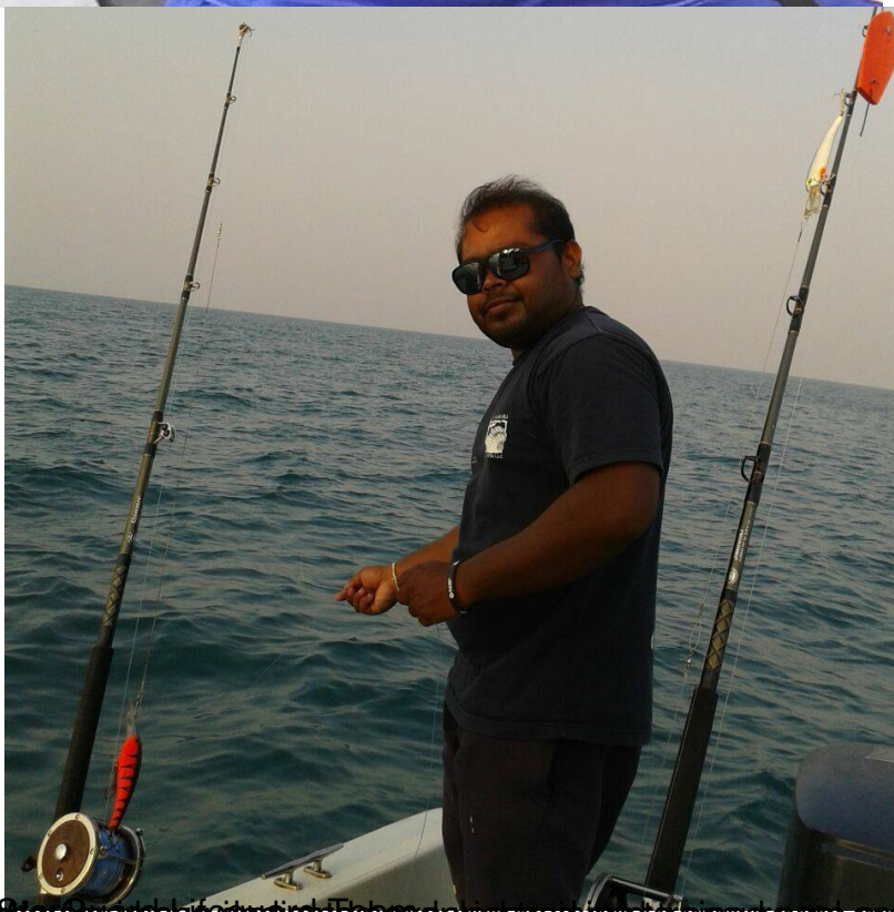
Regular and frequent fish catches experienced and a good insurance provider and a dedicated guard supervisor.