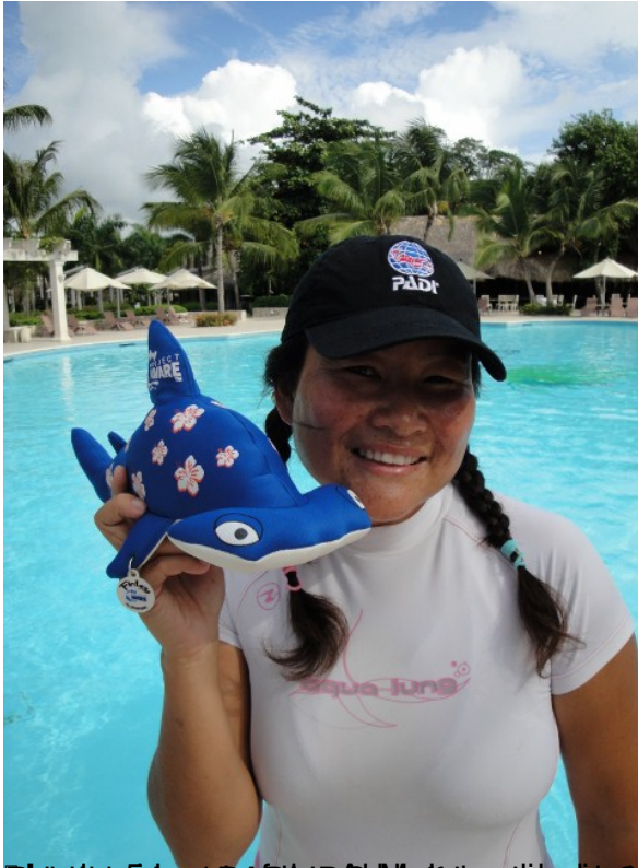
in front of the PADI training center in the Philippines. in front of the PADI training center in the Philippines.